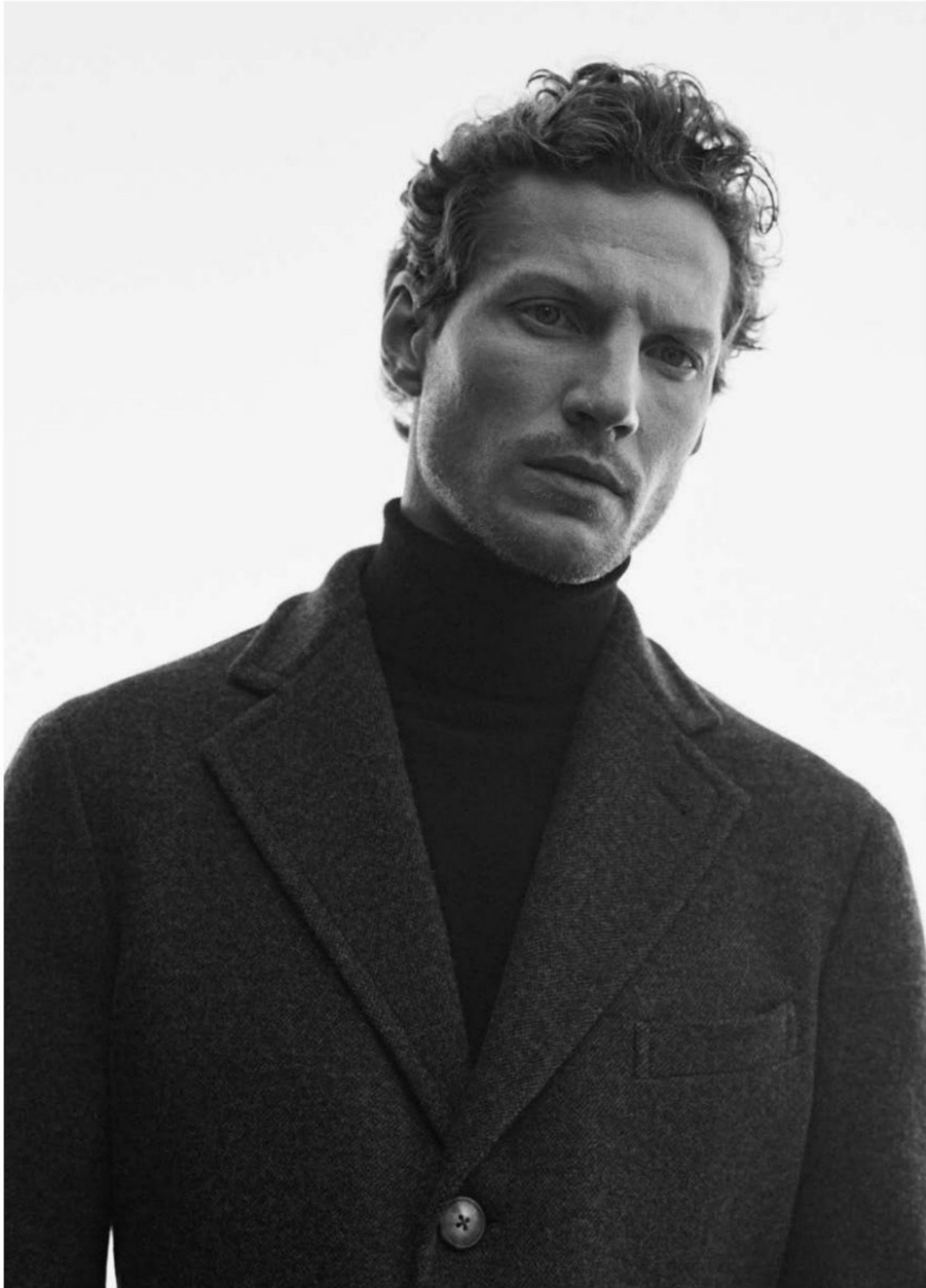
Mantel BOGLIOLI Pullover AIDA BARNI