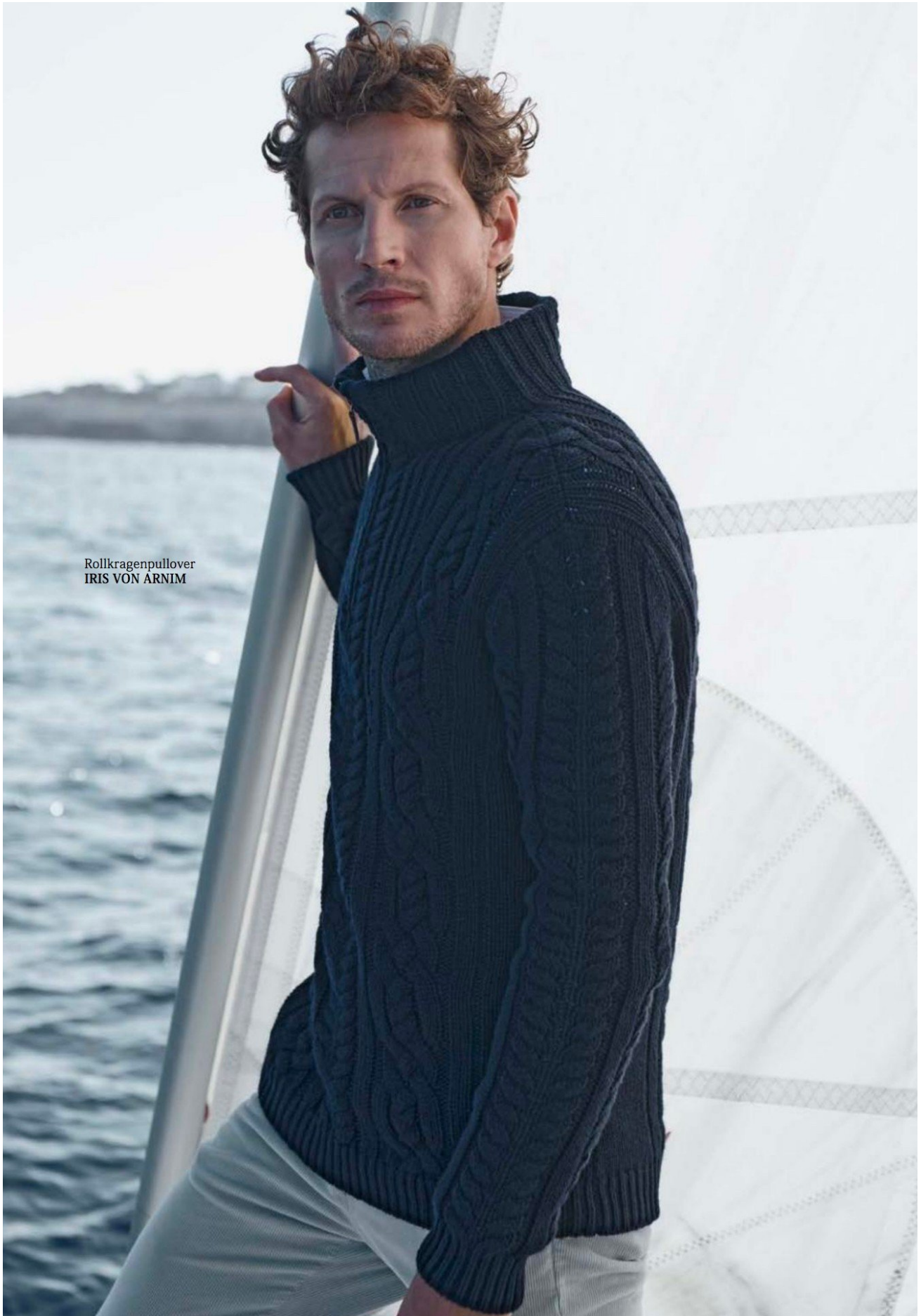
Rollkragenpullover IRIS VON ARNIM

HEIGHT 188 CM / 6'2" | CHEST 98 CM / 38.5" | WAIST 82 / 32.5 | HIPS 92 CM / 36" | HAIR DARK BLONDE | EYES BLUE-GREEN SHOES 44 / 10 | SUIT 48 / 38